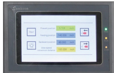
• PLC control with finger touch screen